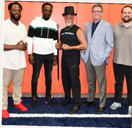
2023 Platinum Dads!