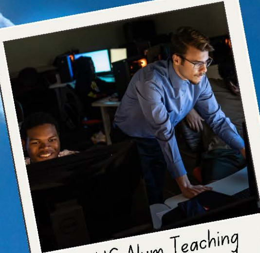
HRHC Alum Teaching at a Summer Camp!