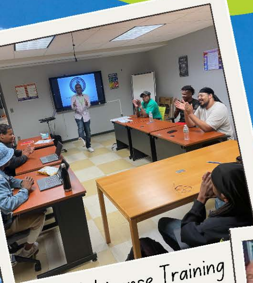
SORA License Training in Trenton!

This year we celebrated 30 years of serving fathers and families and continued to provide fathers and men in need with our workforce development programs fostering independence. We are forever grateful for our community of supporters!