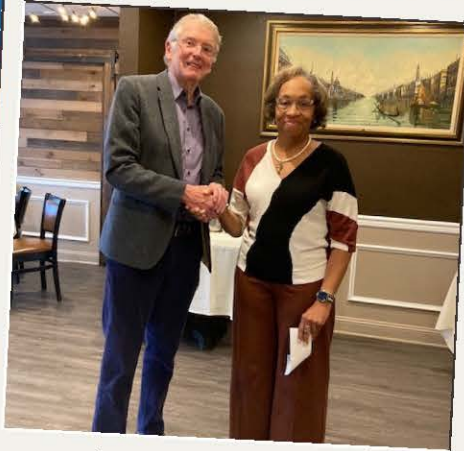
Leadership in the Community!