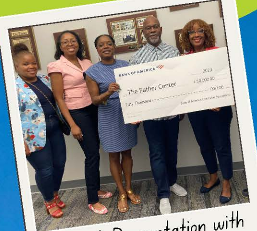
Check Presentation with Bank of America!