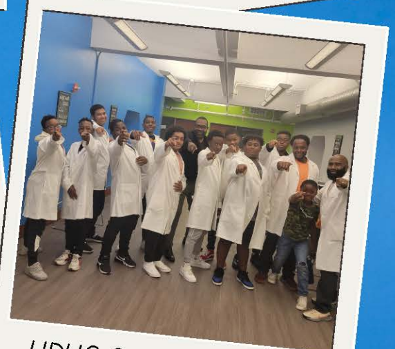
HRHC Cohort in Trenton!